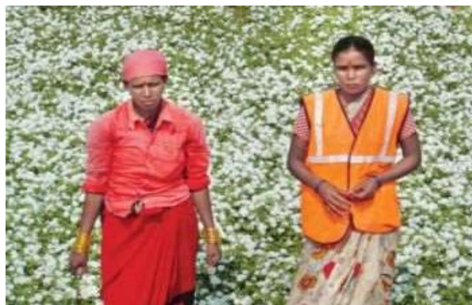
Ghmc women workers